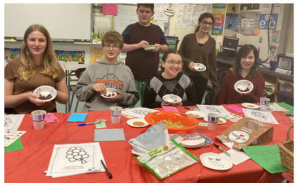
(photo of Spanish club trying the New Year's Eve custom of "Las Doce Uvas"=The 12 Grapes)

needed time off. Last month the PTA held another successful craft fair raising funds to support programs and initiatives in all three of our schools. Additionally, last month the PTA once again sponsored the Academic Achievement/Tiger Leap Ice Cream Social for Akron High School Students. We are proud to help celebrate these student achievements, great job tigers!